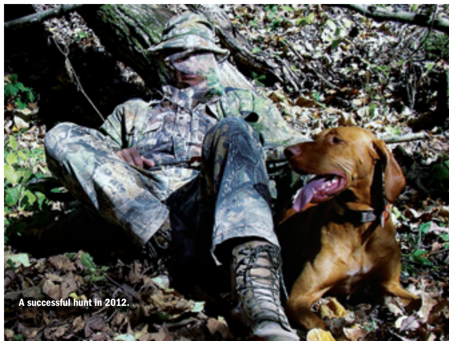
A successful hunt in 2012.

The Wild Turkey Management Plan will guide decisions regarding the allocation of turkey permits, the structure of spring and fall hunting seasons, the use of Wild Turkey Stamp funds, and many other aspects of turkey management in the state through 2025. The current plan reflects recent scientific research and changes in turkey distribution and hunting techniques. The management plan was guided in part by input received at 12 meetings held statewide in 2012, as well as an online survey.