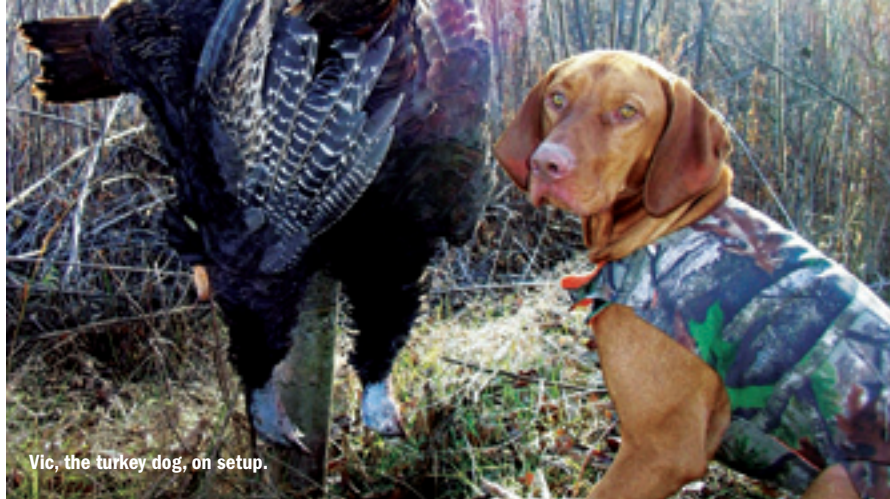
Vic, the turkey dog, on setup.

Another important dimension to Wisconsin’s wild turkey hunting happened when turkey dogs were legalized for the fall turkey hunt season starting in 2011. It is widely believed that hunting turkeys with dogs is a new method, how-